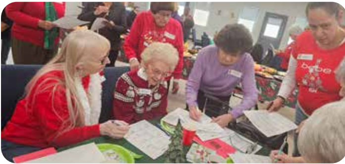
As a mixer, participants looked for three others who had the same answers as theirs in a fun word game.

Mark your calendar: December 14, 2024 is Zion's next Advent Tea. ♥