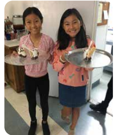
Above: Children from Grace Christian School shop in the “Secret Room” and Youth serve lunch for the Annual Christmas Boutique & Luncheon.