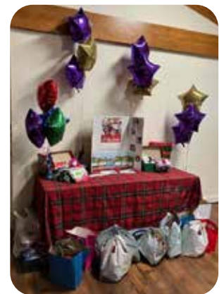
Fall Zone event collected items for Operation Christmas Child.

Convention bags continue to be made for the LWML CNH Convention April 2024, and the three hosting zones will be meeting in February 2024, for the final meeting before the Convention. We look forward to welcoming everyone to the Convention. ♥