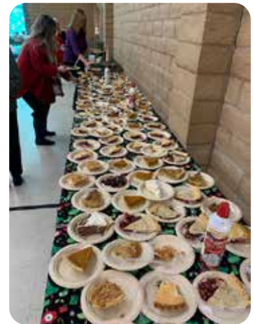
Above: Our "Older But Wiser" Luncheon served about 100 seniors.