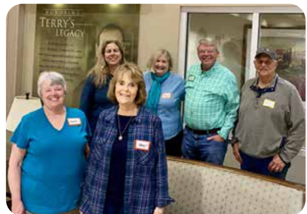
Women of Grace has provided outreach for Terry's House residents for over 10 years.