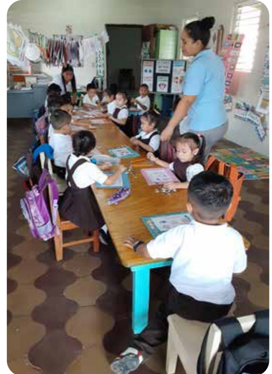
Left: One of the two libraries of books that mites purchased. Above: Little Lambs of Belize at their work tables, dressed in school uniforms.