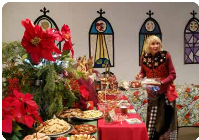
The Holiday Bazaar & Tea was open to the public. All proceeds go to mites and outreach projects.

♥ January 4, 2024: Bible Study had their Christmas luncheon combined with honoring the Leader celebrating her 92nd birthday. It was held at member's home, which was decorated outside and every room inside. A delicious lunch and a great time was had by all! ♥