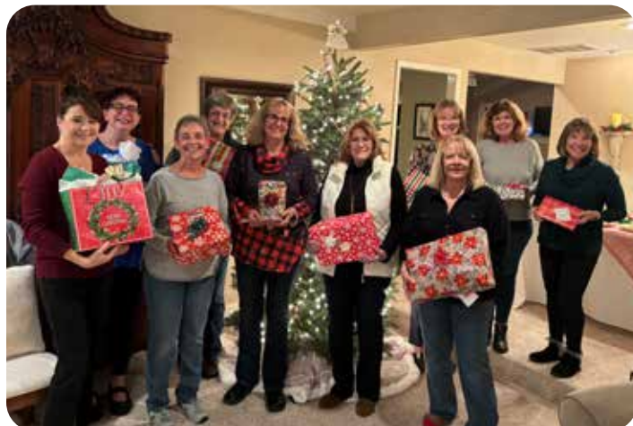
Mary-Martha LWML at Grace Modesto adopted a hospice family whose grandma recently passed away.

The Mary-Martha LWML at Grace Modesto wanted to share our Christmas story! We recently adopted a hospice family whose grandma recently passed away. Her daughter is a single mom with four children who are struggling with the loss of grandma in their lives. We adopted their family and provided warm winter clothes, pajamas, shoes, grocery gift cards and toys—special gifts for all! One of our members even secured a used but fully functional lighted Christmas tree for this family! ♥