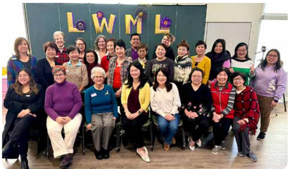
Forty attendees gathered to make goodie bags, sing, play bingo and share the meaning of “Serve with Gladness” at Lutheran Church of the Holy Spirit.

Wishing you all a Blessed New Year filled with joy and continued unity in “Serve the Lord with Gladness” ! ♥