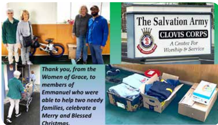
Women of Grace delivered donations to support two families selected by Clovis Salvation Army.

On January 10th, Women of Grace volunteers, providing dinner and support to 34 families with friends or relatives in the Fresno Community Hospital ICU and Prenatal ICU, continue serving the residents of Terry's House with food, prayers, and compassion. The Women of Grace has provided this outreach for Terry's House residents for over ten years. ♥