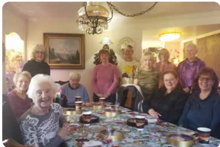
The Christmas Luncheon honored their Bible Study leader who celebrated her 92nd birthday.