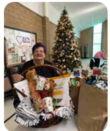
The Basket Bonanza sold 92 professional-quality baskets and brought in over $3400.