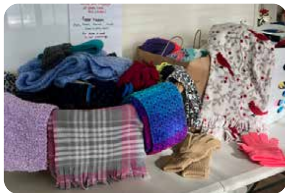
Several dozen articles of winter warmth were donated to our local Nexus Youth and Family Services.

Immanuel LWML of Jackson conducted a Winter Service Project collecting hats, gloves, and scarves to share with people in need in our community. Several dozen articles of winter warmth were donated to our local Nexus Youth and Family Services . The holiday months were busy! In November, we worked with our congregation to fill 25+ Shoeboxes for Operation Christmas Child and also hosted a Baptism Lunch reception on a special Sunday when a family of four was baptized! For our Christmas event, we gathered at the Castle Oaks Golf Course restaurant for our annual Christmas lunch and gift exchange, along with our LWML sisters of Zion Lodi and Foothill Valley Springs. ♥