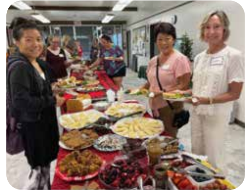
Christ Lutheran Church, Hilo's Mary Martha LWML society held a very successful Christmas Luncheon with 30 members and guests on December 16.

Mary Martha LWML society held a very successful Christmas Luncheon with 30 members and guests on December 16. Fundraising from Christmas Stockings raised money for our two missionaries. Quilting continues to be a monthly activity with quilts donated to the Y. Okutsu Veteran's Home and Liberty Dialysis Center. ♥