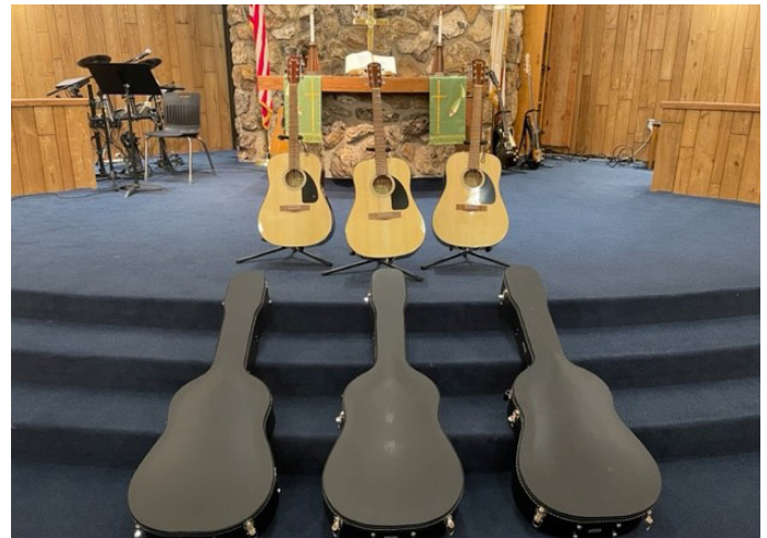
Having more practice instruments allows kids to practice between lessons in their cottages.

"We have talent shows about once a quarter, which provides kids an outlet