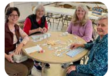
Holy Cross, Concord, ladies meet monthly to play Mexican train dominoes.