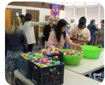
First Lutheran, Concord ladies assisted with the Easter egg hunt Easter Sunday.