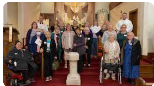
Twenty women gathered for “My Soul Rejoices: A Service of Prayer, Preaching and Song.”