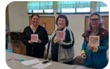
Our Savior LWML made Valentine Cards at the February meeting.