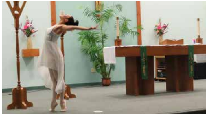
A highlight of Friday evening was a young woman's amazing testimony about her journey from cult to Christianity and her beautiful dance.