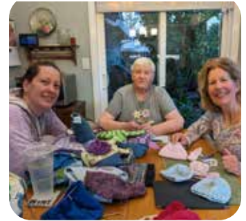
Benicia Lutheran ladies knit booties and caps for local shelters and NICU.