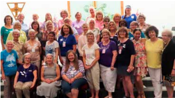
48 women from 11 churches in Zones 4 and 19 enjoyed this Retreat.

We are treasured by our Lord who paid the ultimate price for us. From a lump of coal to a dazzling diamond, we are continually being transformed in Christ. Four presenters led a Bible study about how we can shine brightly as we reflect God's light in a dark world. There was also fun with a skit, raffle, and even some stretching exercises. A praise team led us in songs, including an original song, "Treasured." Breakfast and a salad bar lunch were served with desserts of crown cupcakes, ring cookies, and bling lollipops.